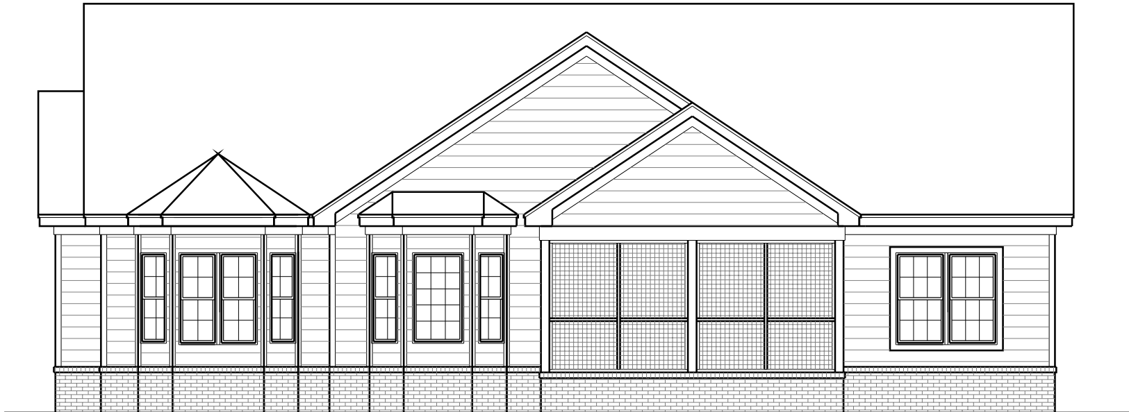
Tidewater I Rear Elevation