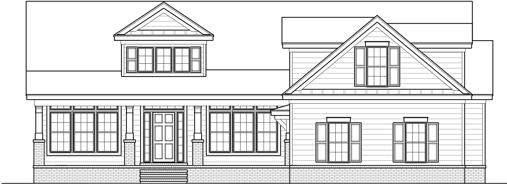
Tidewater I Front Elevation Scale: 1/4" = 1'-0"