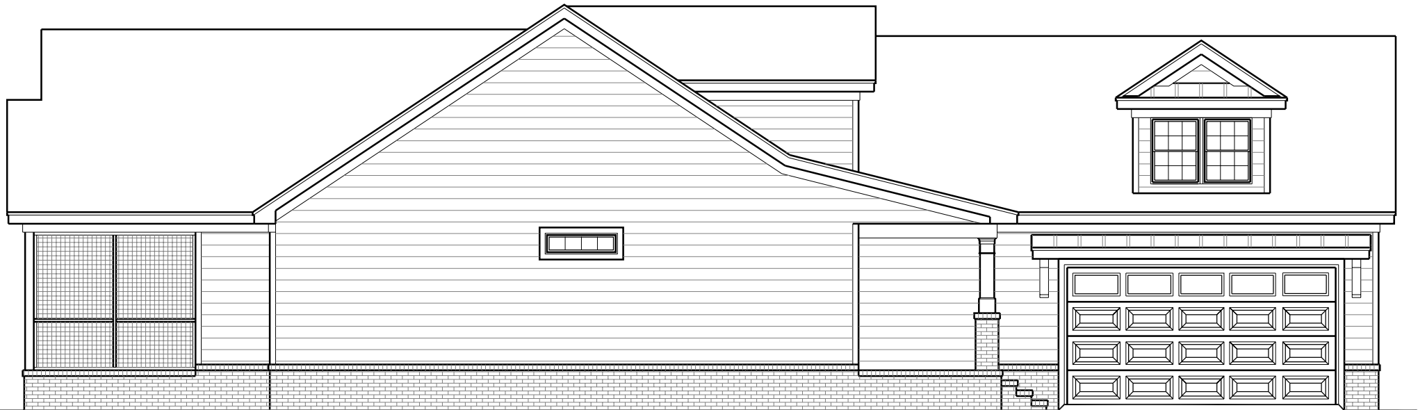
Tidewater I Left Side Elevation