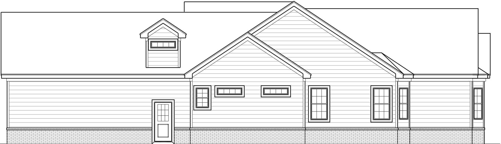
Tidewater I Right Side Elevation Scale: 1/4" = 1'-0"