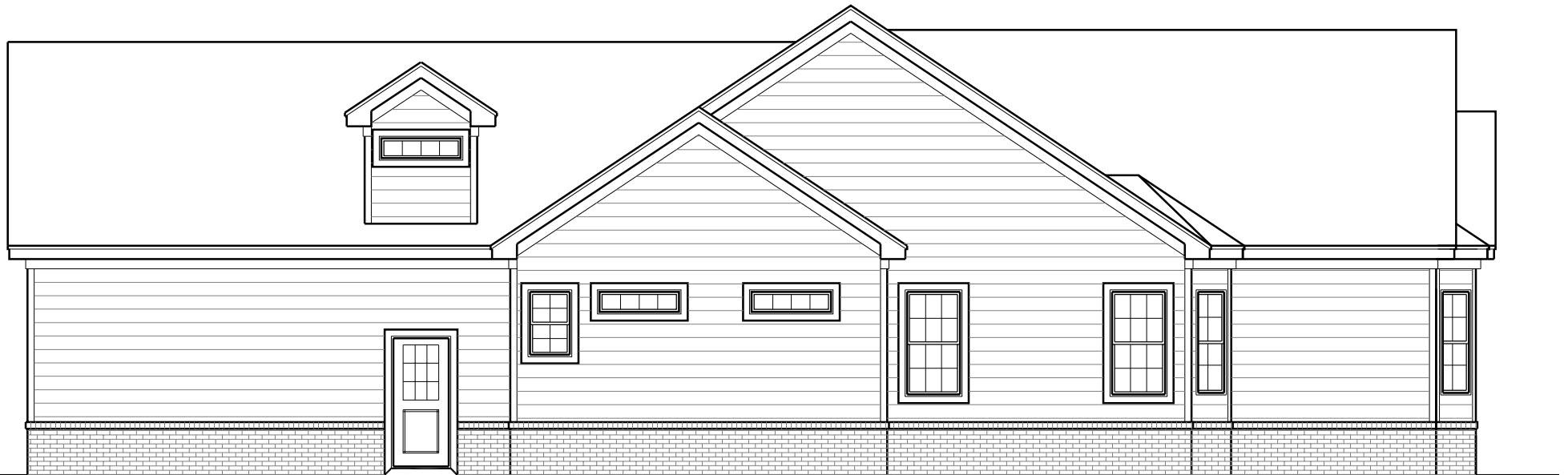
Tidewater II Right Side Elevation Scale: 1/4" = 1'-0"