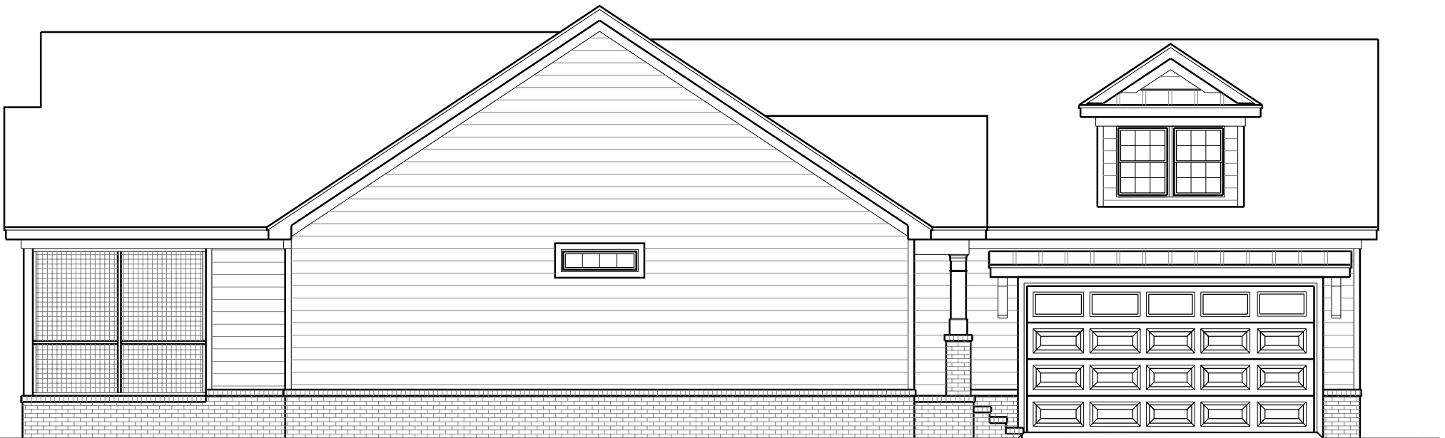
Tidewater II Left Side Elevation Scale: 1/4" = 1'-0"